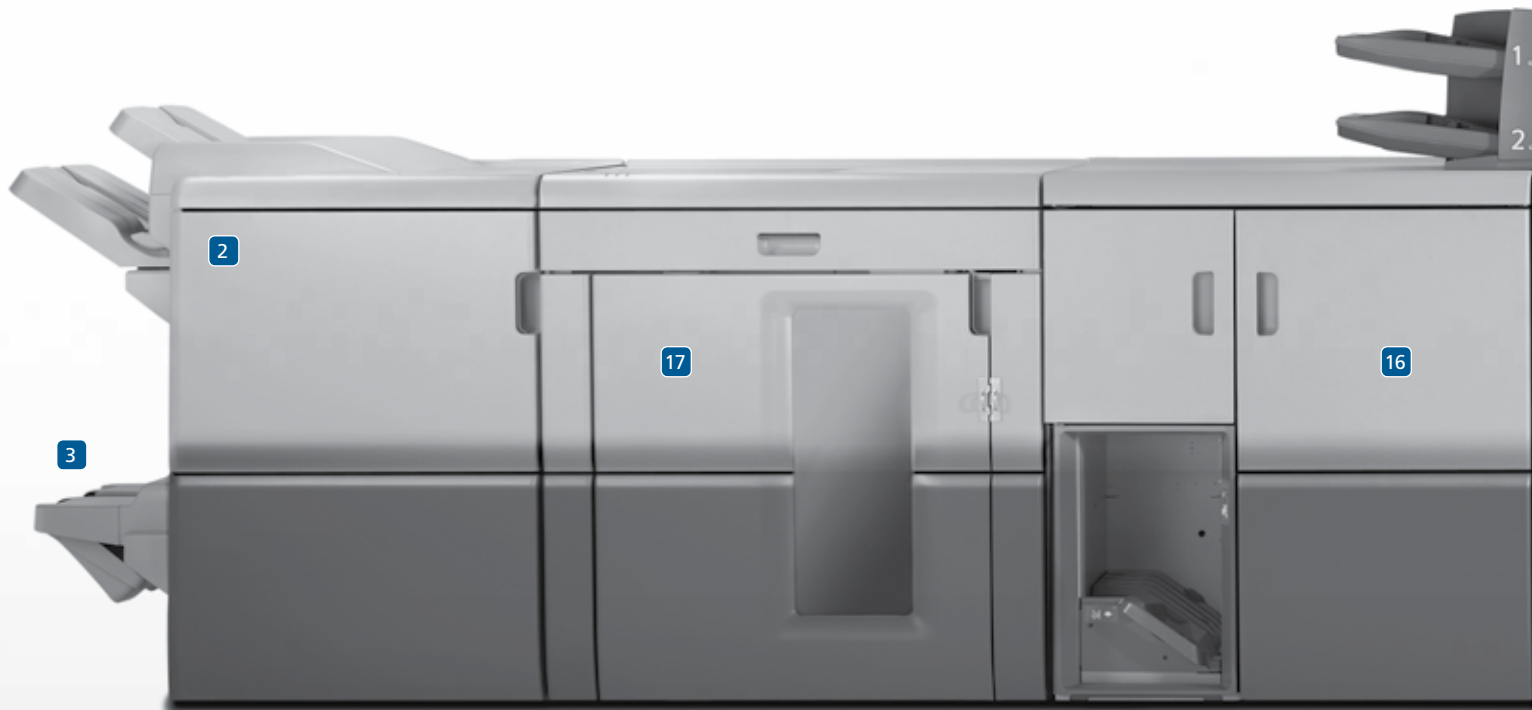
RICOH Pro 8100 Series